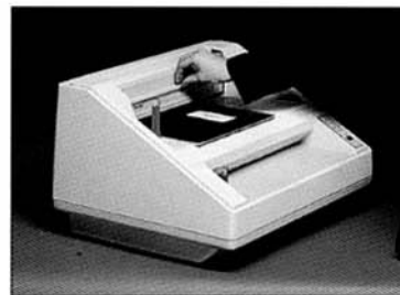
Third, set the machine to bind and lower the pressure bar.